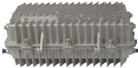
1310nm Outdoor Optical Relay Station